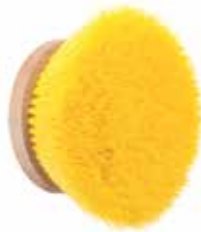
The Salient Point