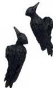
Zorro (black Woodpecker)